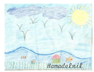
Please check out the Enewsletter on our website www. krtams.org to see all students' work in full.